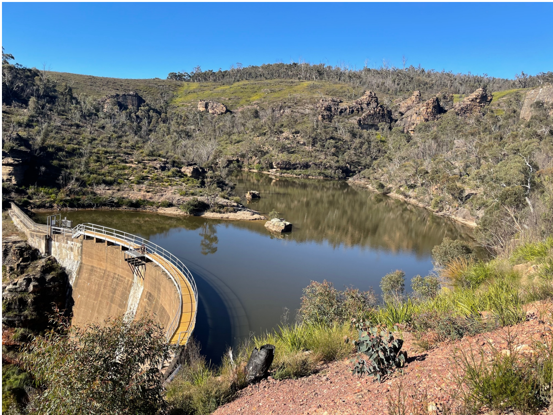
Lithgow No. 2 Dam in the Blue Mountains, owned by Lithgow City Council.

A written report of an incident in a form approved by Dams Safety NSW must be given to Dams Safety NSW no later than 72 hours after the incident, even if an oral report of the incident has already been given. Click here to complete the online incident report form .