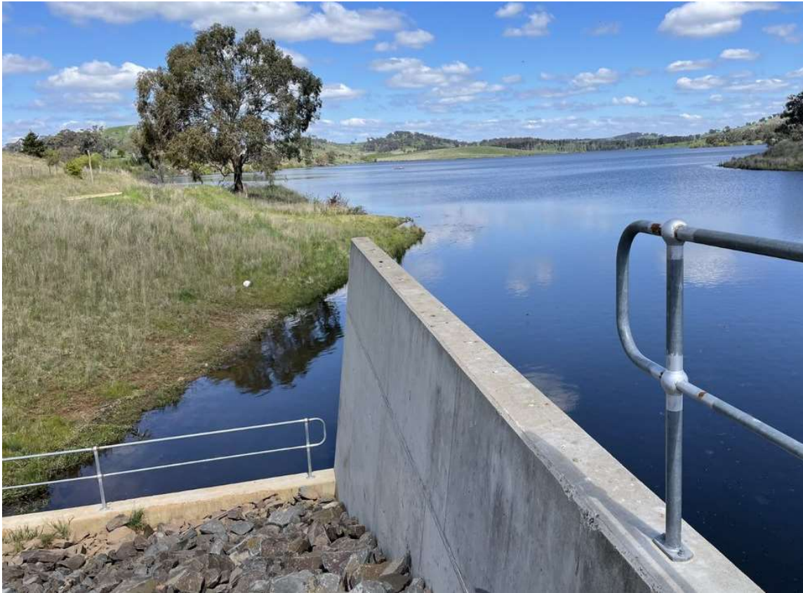
Emergency exercises forum

We are the State's independent regulator responsible for ensuring dam owners manage the safety of their declared dams.