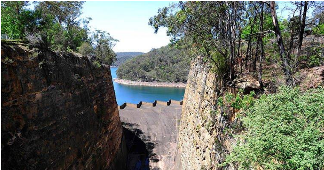
Avon Dam, one of four dams that make up the Upper Nepean water supply scheme south of Sydney on the Illawarra Plateau.

The closing date for feedback is 30 October 2020. If you have any questions please call 0409 784 535 or email us at communications@damsafety.nsw.gov.au .