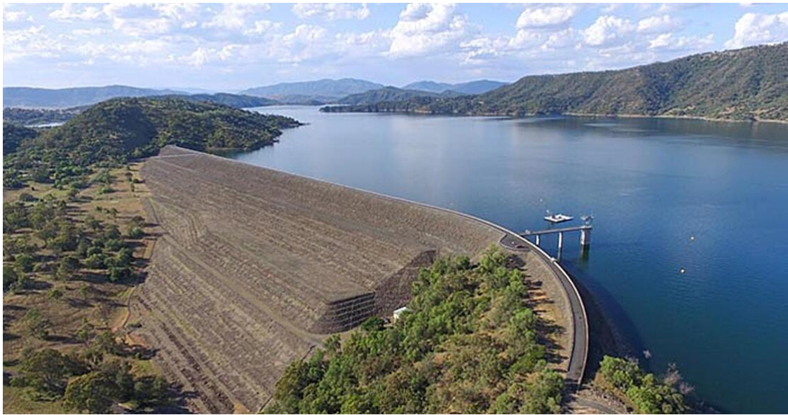
Glenbawn Dam, near Scone. The dam has one of the largest rock-fill embankment walls in Australia, 100 metres high and 1.1 kilometres long.