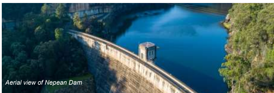
Aerial view of Nepean Dam

If you have changes underway and you're not sure if we are aware of them, please call us on (02) 9842 8073 or email us at info@damsafety.nsw.gov.au to discuss the work.